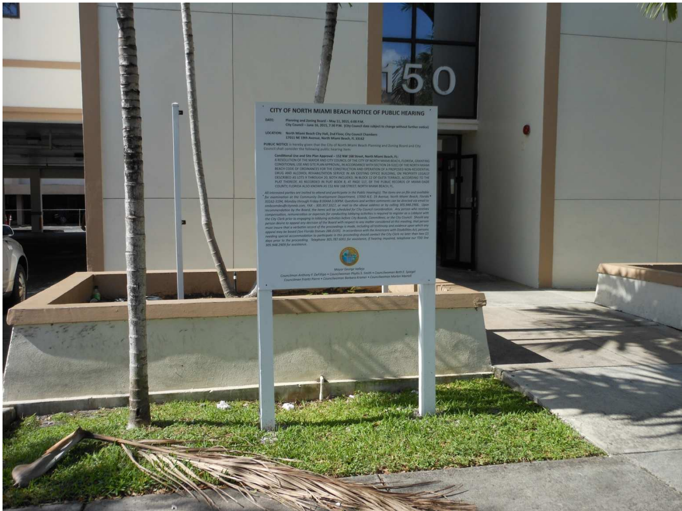
Site sign installed on April 27, 2015