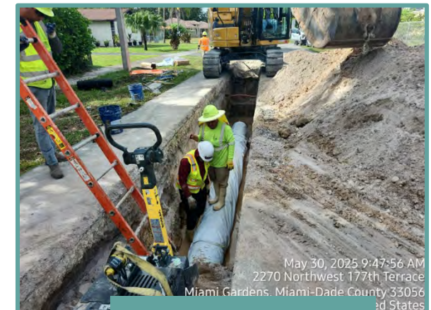
Master Pump #4