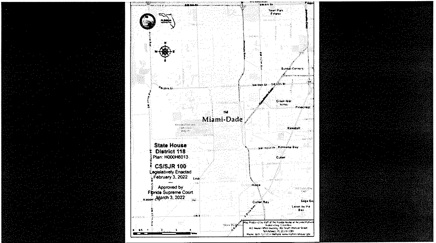
Map of Florida House District 118 Florida House of Representatives