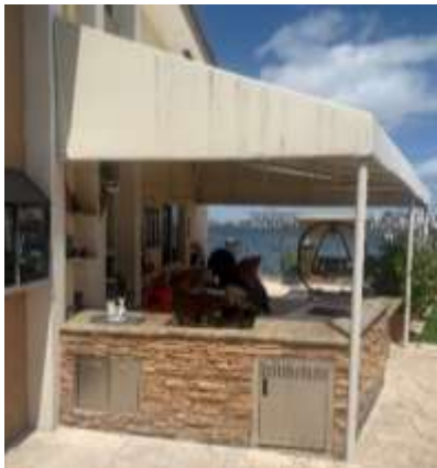
Photo of the awning at 2811 NE 164 th St. Unit 1.