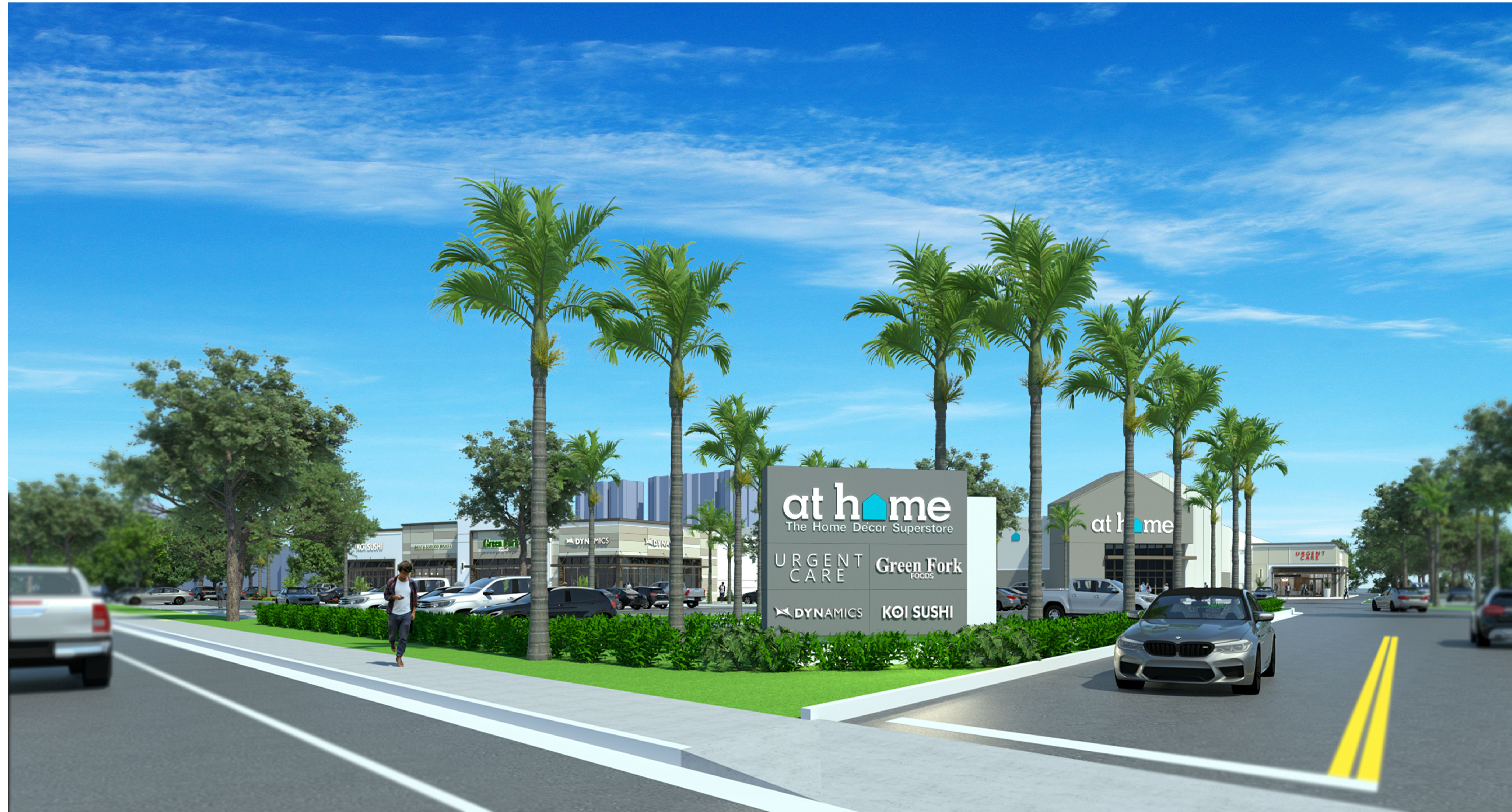
11 Model Image SCALE: N.T.S.